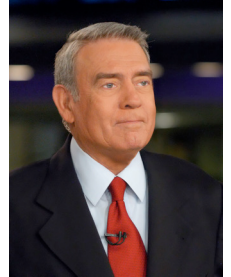
DAN RATHER Broadcast Journalist