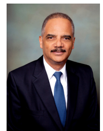
ERIC HOLDER Former U.S. Attorney General

Conference Registration Urban Schools Resource Room/Internet Cafe General Session C: Breakfast and Speaker: DONNA BRAZILE CONCURRENT SESSIONS ON BEST PRACTICES General Session D: Lunch and Speaker: ERIC HOLDER General Session E: Town Hall Meeting Urban Education and the Presidential Campaign Moderated by: DAN RATHER Great City Colleges of Education General Meeting Reception at the Biscayne Lady Yacht