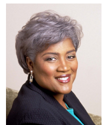
DONNA BRAZILE Political Commentator