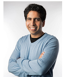
SAL KHAN Founder & CEO Khan Academy

Conference Registration Urban Schools Resource Room/Internet Cafe General Session A: Breakfast and Address from Chair of the Board CONCURRENT SESSIONS ON BEST PRACTICES General Session B: Lunch and Speaker: SAL KHAN CONCURRENT SESSIONS ON BEST PRACTICES Executive Committee Meeting Cocktail Reception 27th Annual Green-Garner Banquet ( Semi Formal Evening Attire ) Hospitality Suite- Karaoke Night